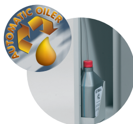
AUTOMATIC OILER - AO

A light comes on when the blades need to be oiled