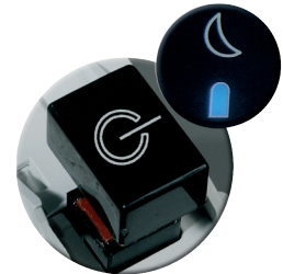
AUTOMATIC DISCONNECTION FROM THE MAINS

No longer any need to switch off the shredder before leaving the office. Maximum power saving