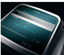
TOUCH SCREEN PANEL

AUTOMATIC OILER integrated automatic oiling system to lubricate the cutting knives