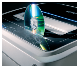
TWO ENTRY OPENINGS AND TWO SETS OF CUTTING KNIVES

Sturdy and large volume 205 liters steel cabinet equipped with a built-in automatic oiling system which eliminates the need for manual oiling of cutting knives