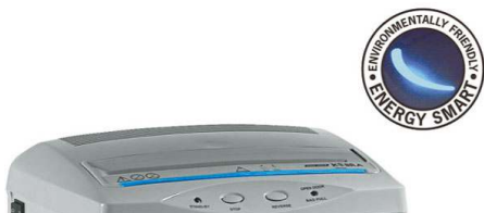
"ENERGY SMART" Management system for power saving stand-by mode