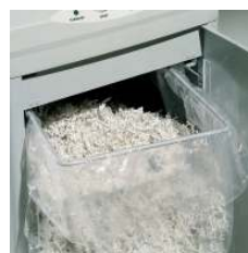
Front door for easy emptying of collecting bag