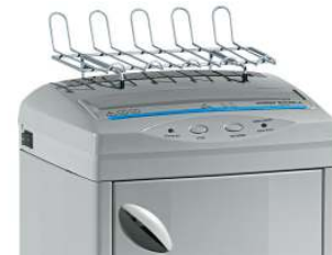
Computer forms top shelf to save office space (Space Saving Design)