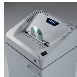
AUTO START & CD SHREDDING Automatic Start/Stop through electronic eyes. Integrated flap for CDs, DVDs, Floppy Disks and Credit Cards shredding