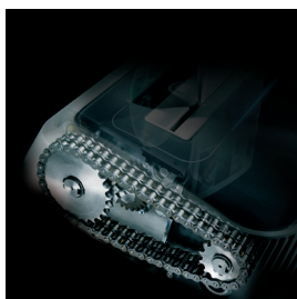
CHAIN heavy duty chain drive system and metal gears