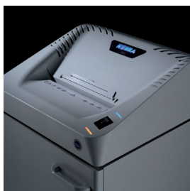
LED INDICATORS Easy to operate ON OFF Reverse switch, with LED signal for bag full or open door