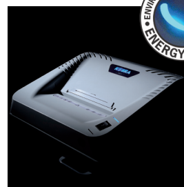
ENERGY SMART ® management system with illuminated indicators for power saving in stand-by mode