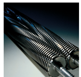
CUTTING KNIVES IN HARDENED STEEL unaffected by staples and metal clips