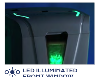
FRONT WINDOW LED illuminated waste bin to check the shred level.