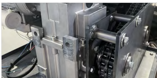
"TITAN-COLOSSUS" GEARMOTOR DRIVE shreds SSDs with metal casings

Touch-screen operating panel: controls are activated by simply touching the intuitive control panel with LED indicators.