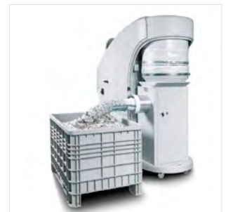
KOBRA COMPACTOR C-500 reduces by 4-5 times the volume of the shredded paper. Shredded and compacted paper can be collected into any type of container or into plastic waste bags. Compacting paper increases security of one level (ISO/IEC 21964).