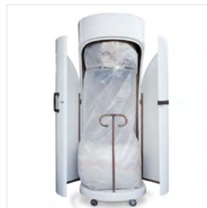
Kobra Cyclone (standard version) utilizes a 400 litre plastic waste bag. Full bags are easily removed and disposed of assisted by the built-in-trolley.