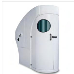
Rear window for easy checking of waste bag level.