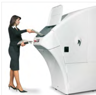
INNOVATIVE SHREDDING SYSTEM BASED ON A TURBINE COMBINED WITH HIGH SPEED ROTATING BLADES