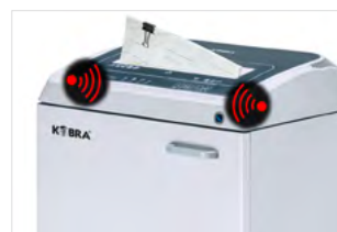
METAL DETECTION SYSTEM SHRED GUARD

The Shred Guard System stops the machine when large metal objects are accidentally inserted. An illuminated optical indicator warns the operator to remove these objects in order to protect the knives.