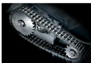
SUPER POTENTIAL POWER SYSTEM

Shows the shredding load required to optimize shredding without jams.