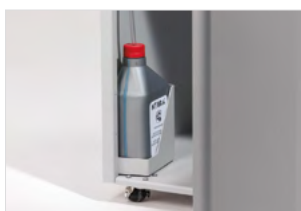
INTEGRATED AUTOMATIC OILING SYSTEM

Heavy duty chain drive with steel gears which offer reliability and resistance to wear.