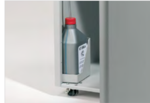
AUTOMATIC OILING SYSTEM

The lockable cover protects top-secrets or confidential documents waiting to be shredded when the shredder is left unattended. It is supplied with high security non-duplicable key.