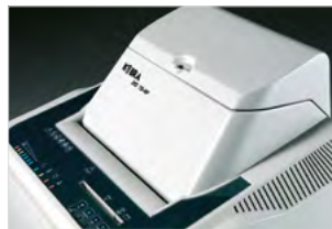
LOCKABLE COVER (LK)

It can shred automatically 170 sheets, whilst the operator can shred paper in the main throat and CDs/DVDs/Credit through the dedicated cutting unit, at the same time.