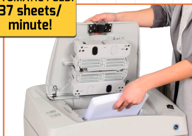
Up to 400 sheets paper tray for auto-feed system: 37 sheets per minute shredding speed