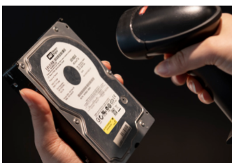
Scans serial numbers of hard disks before erasure