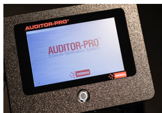
Creates erasure certificates – Touchscreen operation