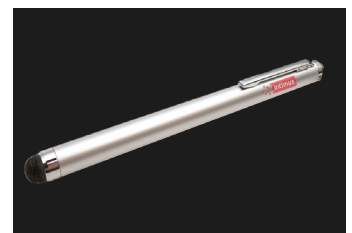
Stylus for comfortable operation of the touchscreen