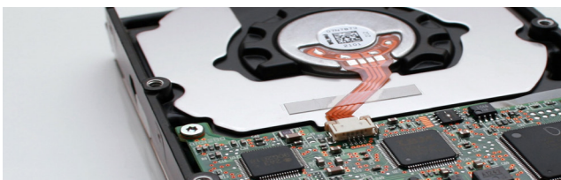
Secure and complete data erasure on hard disks