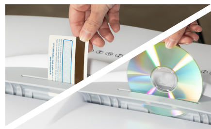
Credit cards and CDs can also be shredded via a separate feeding slot.