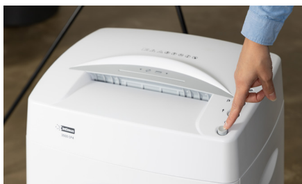
Automatic start/stop function and anti-paper jam technology.