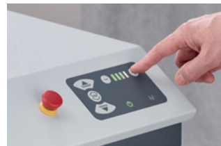
Feed-in speed adjustable