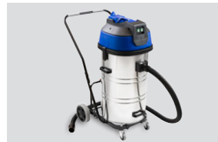
HSM ProfiPack P425 has an optional suction device