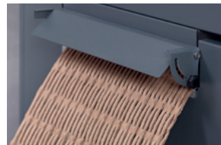
Creation of padding mats (one layer of cardboard, HSM ProfiPack P425).