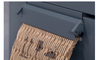
Creation of compressed packaging material with a closed compression flap (two layers of cardboard, HSM ProfiPack P425).