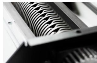
Specially hardened cutting rollers for precision cutting