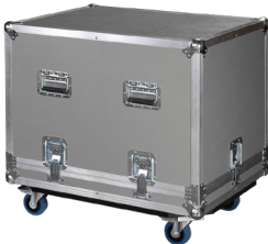
CASE-TS4XTIC transport case