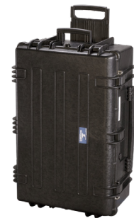
CASE-ICHD3 MIL SPEC shipping case