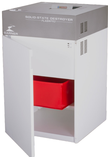
Comes equipped with catch basket and disposable liner.