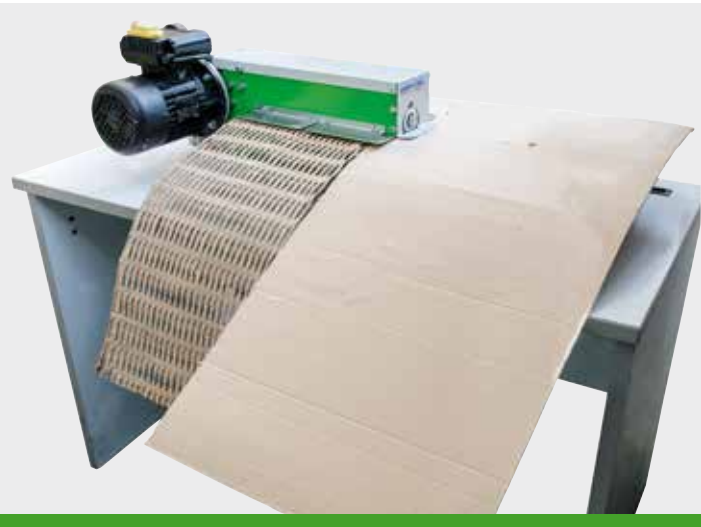
EDWARD 299 ON BENCH