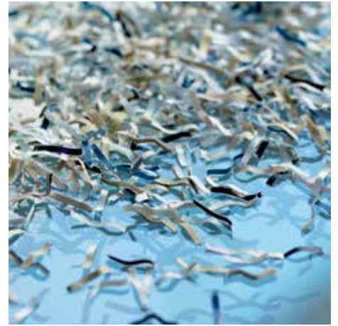
P-5 security: recommended, for example, for data media containing secret data