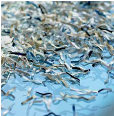
P-5 security: recommended, for example, for data media containing secret data