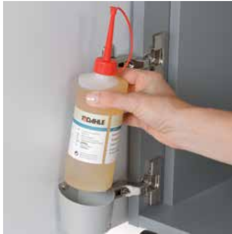
Environmentally friendly oil is always easy to access, included with all cross-cut models