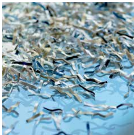
P-5 security: recommended, for example, for data media containing secret data