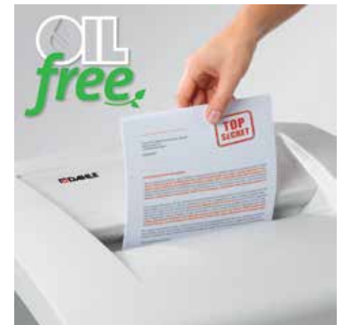
Shredding the convenient way, all without the time-consuming process of oiling the cutters