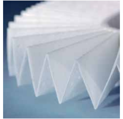
Environmentally friendly filter is made of special 3-ply, fully recyclable non-woven material