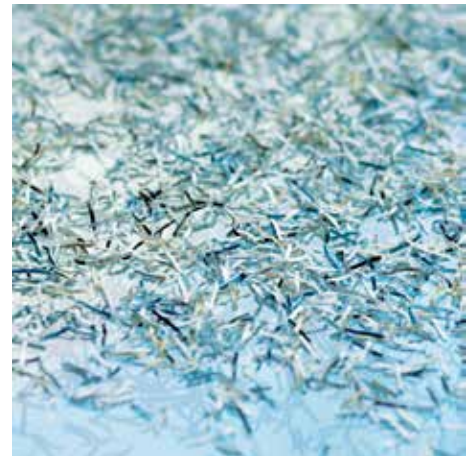
P-6 security: recommended for data media containing secret data demanding exceptionally stringent security measures