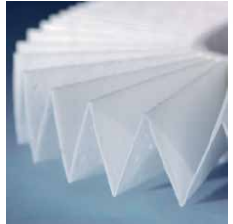
Environmentally friendly filter is made of special 3-ply, fully recyclable non-woven material