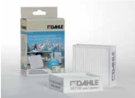
Fine particle filters Dahle 20710