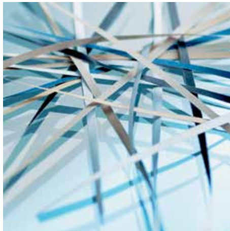
P-2 security: recommended, for example, for data media containing internal data that are to be made illegible