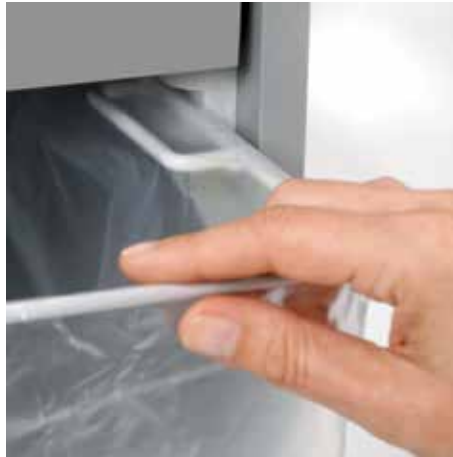
Pull-out rounded top frame that's kind on the fingers when changing the waste bag