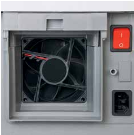
Powerful fan sucks in fine dust particles inside the document shredder and feeds them to the filter