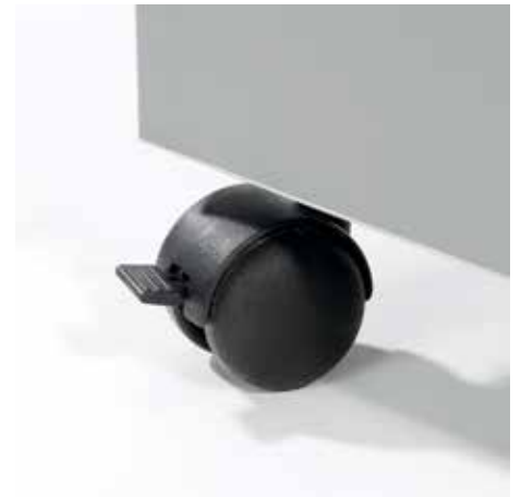
Practical swivel casters for flexible use