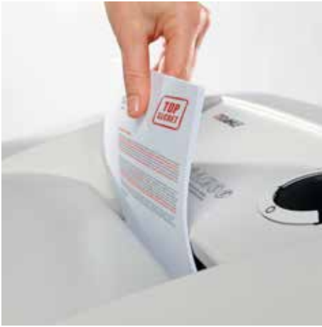
Innovative MHP technology® shreds up to 30 % more paper