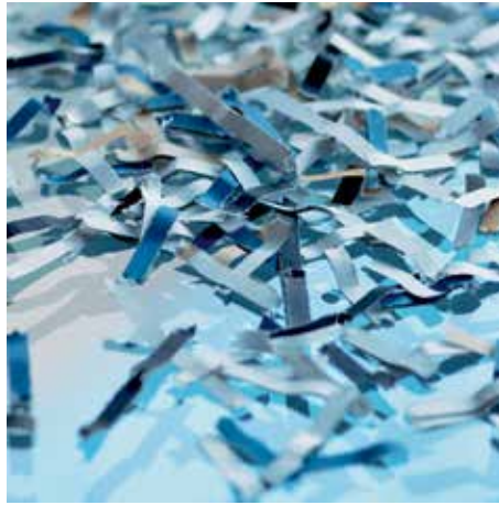
P-4 security: recommended, for example, for data media containing particularly sensitive, confidential and personal data