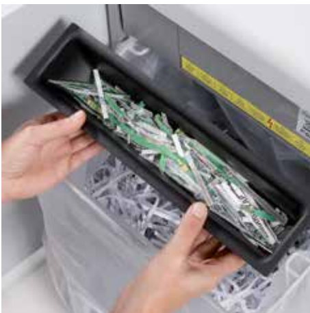
Separate, integrated waste boxes help to sort shredded paper, CDs, DVDs, cheque and credit cards for eco-friendly recycling