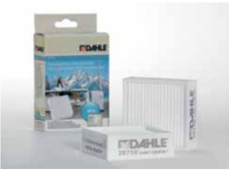
Fine particle filters Dahle 20710