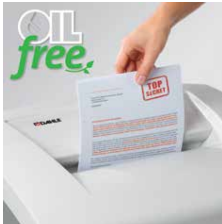
Shredding the convenient way, all without the time-consuming process of oiling the cutters