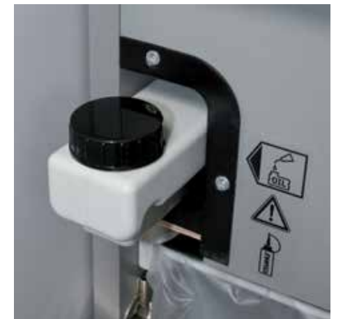
Integrated oil tank for controlled, automatic lubrication of the cross-cut cutters helps to lengthen service life while keeping performance constant