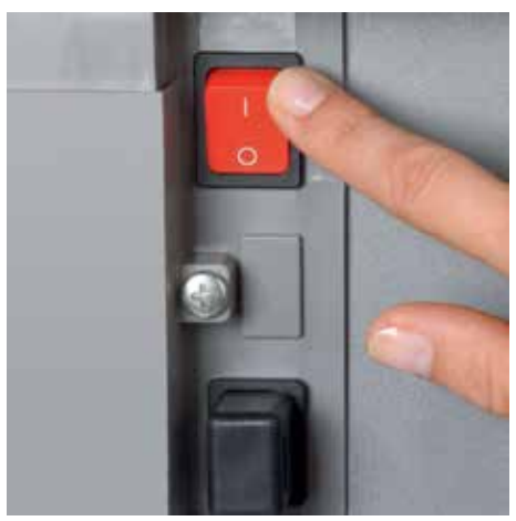
Separate main switch is located on the rear of the Detachable IEC power plug makes the document document shredder and completely disconnects shredder quick and easy to move from A to B it from the mains power supply