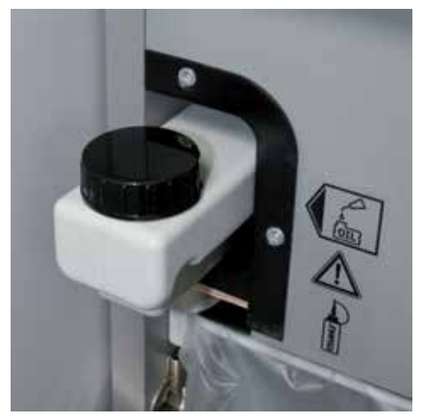
Integrated oil tank for controlled, automatic lubri- P-7 security: recommended for data media cation of the cross-cut cutters helps to lengthen service life while keeping performance constant