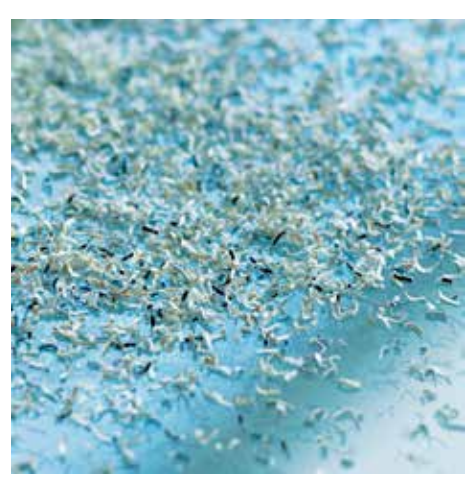
containing top secret data demanding maximum security measures