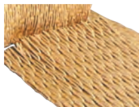
Protective matting for wrapping and layering