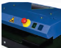
Fitted with IEC/EN 60204-1 compliant circuit breaker