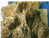
High bulk void fill from waste cartons