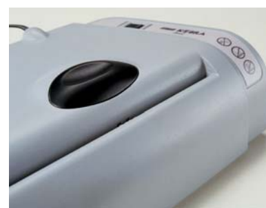
Automatic Start-Stop system with an additional switch to clear heavy paper jams

* Capacity may vary on power supply, paper quality and lubrication of cutting knives