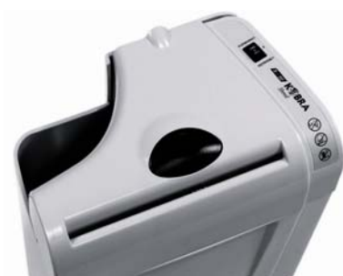
Modern and innovative design. Convenient waste bin opening to allow the waste of non-shredable material