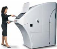
Easy to use Just press the start button, throw the material into the large entry opening and leave

Optional accessory designed to work with the Cyclone industrial shredder when paper is being shredded. When shredding other materials, you simply remove the compactor and use standard Cyclone disposal bags. Kobra Compactor C-500 compresses and reduces the volume of the shredded paper by 4 to 5 times to minimize the space required for disposal. Easy to install and operate, it works with any Cyclone security level screen.