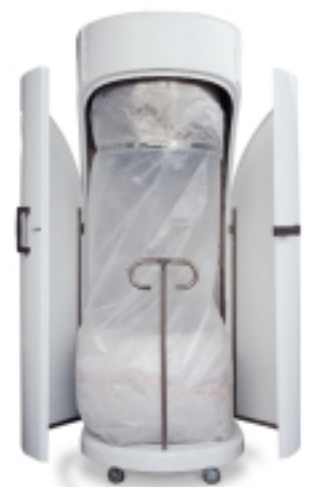
Kobra CYCLONE (standard version) Kobra Cyclone utilizes a plastic waste bag to store shredded materials in an internal storage compartment. Full bags are easily removed and disposed of assisted by the built-in-trolley

The Kobra Compactor model C-500 is designed to work with the Cyclone industrial shredder when paper is being shredded. When shredding other materials, you simply remove the compactor and use standard Cyclone disposal bags. This optional accessory compresses and reduces the volume of the shredded paper by 4 to 5 times to minimize the space required for disposal. Easy to install and operate, the Kobra Compactor C-500 and will work with any Cyclone security level screen. Compacted shredded paper can be collected into any type of container or into plastic waste bags.