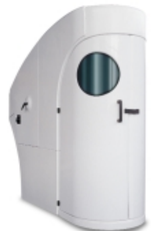
Rear window for easy checking of waste bag level