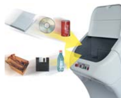
Wide throat Kobra Cyclone can shred up to 500 sheets of paper at a time, credit cards, CDs, DVDs, Blu-ray, floppy-disks, Cardboard, plastic bottles, aluminium cans