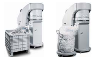
Kobra Cyclone + Compactor C-500 Shredded and compacted paper can be collected into any type of container or into plastic waste bags