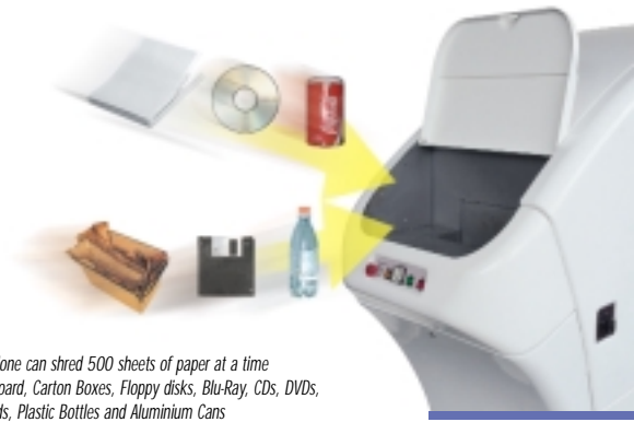
Kobra Cyclone can shred 500 sheets of paper at a time and Cardboard, Carton Boxes, Floppy disks, Blu-Ray, CDs, DVDs, Credit Cards, Plastic Bottles and Aluminium Cans

Kobra Cyclone is equipped with a turbine generating a high pressure air flow and sets of high speed rotating blades. By making the air stream spin, particles are subjected to centrifugal forces and deposited from the air flow into the disposal bag. This unique shredding system, delivers the highest shredding performance and efficiency along with maximum flexibility in choosing the correct Security and bulk reduction Level for a given application. Cyclone does not require the special maintenance and complicated oiling procedures that other machines with similar output rates do. Cyclone is designed for high volume shredding and maintenance free operation.