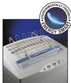
Adjustable computer forms top shelf (Space Saving Design). Integrated sliding flap makes Floppy-Disks and CDs shredding easy