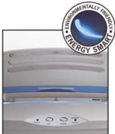
"ENERGY SMART" Management system for zero power consumption in Stand-by mode