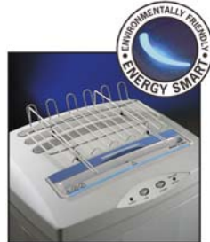
Adjustable computer forms top shelf (Space Saving Design). Integrated sliding flap makes Floppy-Disks and CDs shredding easy