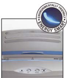
"ENERGY SMART" Management system for zero power consumption in Stand-by mode