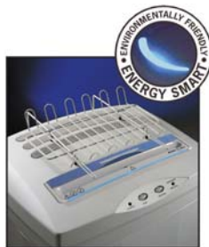
Adjustable computer forms top shelf (Space Saving Design). Integrated sliding flap makes Floppy-Disk and CD shredding easy