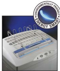
Adjustable computer forms top shelf (Space Saving Design). Integrated sliding flap makes Floppy-Disks and CDs shredding easy