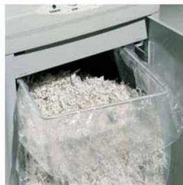
Front door for easy emptying of collecting bag