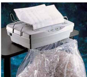
Table top computer forms shredder