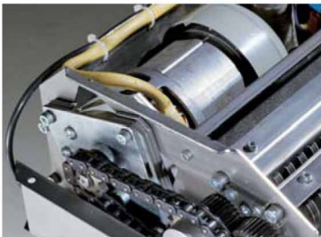
Sturdy heavy duty chain drive with steel gears