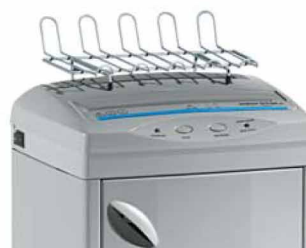
Computer forms top shelf to save office space (Space Saving Design)