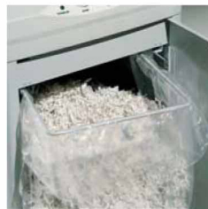
Front door for easy emptying of collecting bag