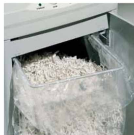
Front door for easy emptying of collecting bag