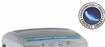
"ENERGY SMART" Management system for zero power consumption in Stand-by mode