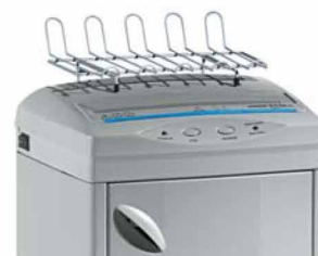
Computer forms top shelf to save office space (Space Saving Design)