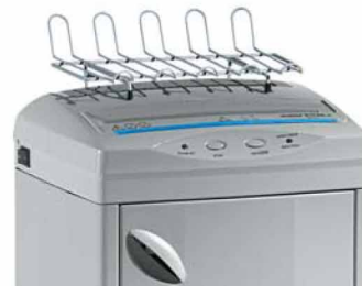
Computer forms top shelf to save office space (Space Saving Design)