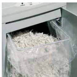
Front door for easy emptying of collecting bag