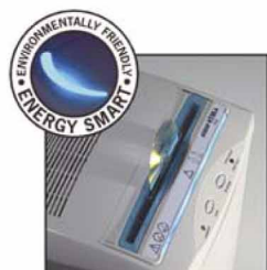
"ENERGY SMART" Management system for zero power consumption in Stand-by mode