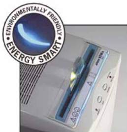
"ENERGY SMART" Management system for zero power consumption in Stand-by mode