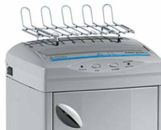
Computer forms top shelf to save office space (Space Saving Design)