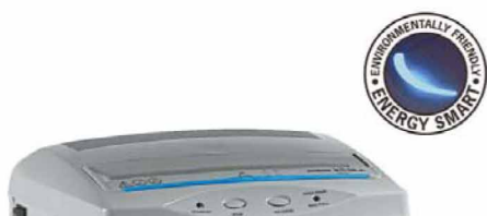
“ENERGY SMART” Management system for zero power consumption in Stand-by mode