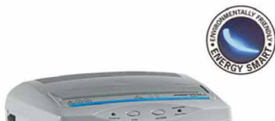
"ENERGY SMART" Management system for zero power consumption in Stand-by mode