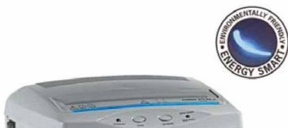
"ENERGY SMART" Management system for zero power consumption in Stand-by mode