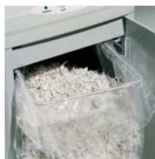
Front door for easy emptying of collecting bag