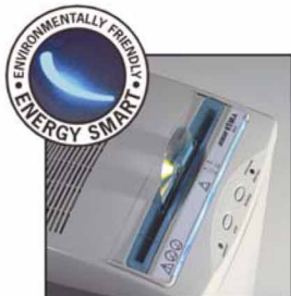
"ENERGY SMART" Management system for zero power consumption in Stand-by mode