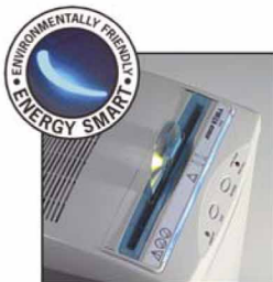
"ENERGY SMART" Management system for zero power consumption in Stand-by mode