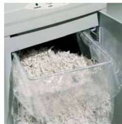
Front door for easy emptying of collecting bag