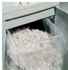
Front door for easy emptying of collecting bag