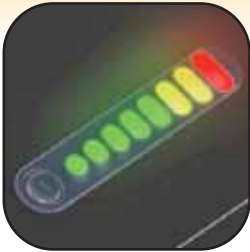
Usage indicators showing shredder capacity