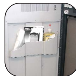
Internal storage area for shredder bags and oil