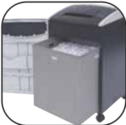
Easy to empty pull-out bin and internal storage area