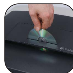
Safely shreds CD's