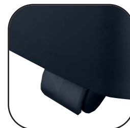
Castors increase mobility