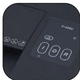
User-friendly control panel