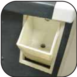
Easy and clean auto-oil mechanism