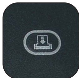
Turbo jam release button clears jams quickly & easily