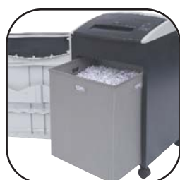
Easy to empty large cabinet style bin with pull out waste basket