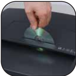
Safely shreds CDs