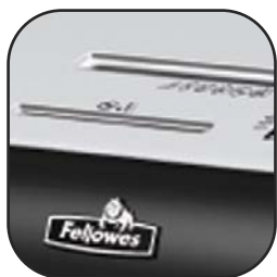
Separate throat & waste bin for CDs allows waste to be segregated