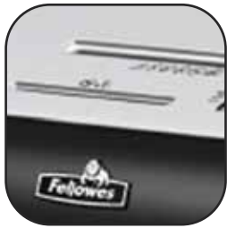
Separate throat & waste bin for CDs allows waste to be segregated