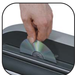
Safely shreds CDs