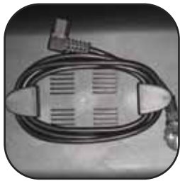
Cable tidy at rear