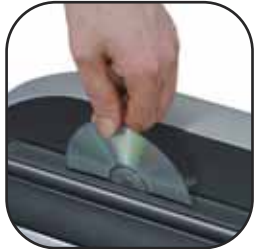
Safely shreds CDs