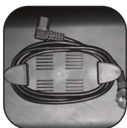
Cable tidy at rear