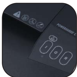
User-friendly control panel