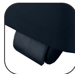
Castors increase mobility