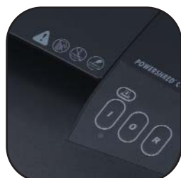
User-friendly control panel