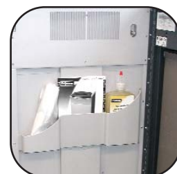
Internal storage area for shredder bags and oil