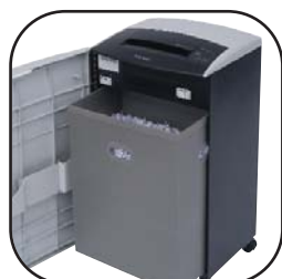
Easy to empty cabinet style bin with pull out waste basket