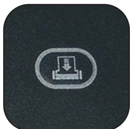
Turbo jam release button clears jams quickly & easily