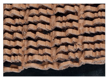
Variable cushioning volume

The induction-hardened solid steel cutting rollers are wear-resistant against cardboard staples and guarantee durability.