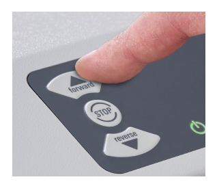
The integrated turbo-function resolves blockages by making more power available for a short time.