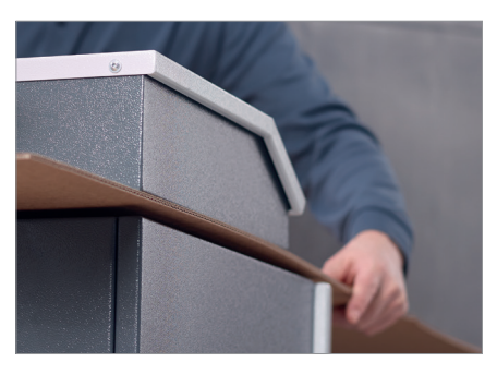
Continuous operation Powerful drive allows continuous operation.

The packaging material can be used wherever required and provides an optimum protection for objects.