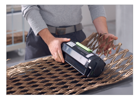
High-quality packaging material

The packaging material can be used wherever required and provides an optimum protection for objects.