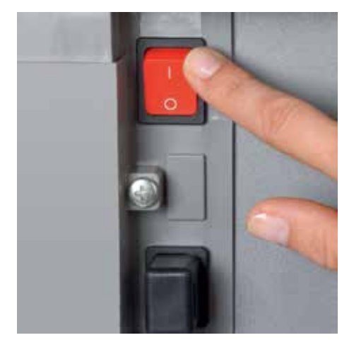
Separate main switch is located on the rear of the<br/>document shredder and completely disconnectsDetachable IEC power plug makes the document<br/>shredder quick and easy to move from A to BEnvironmentally friendly oil is always easy to<br/>access, included with all cross-cut models it from the mains power supply