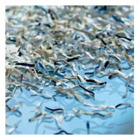
P-5 security: recommended, for example, for data media containing secret data