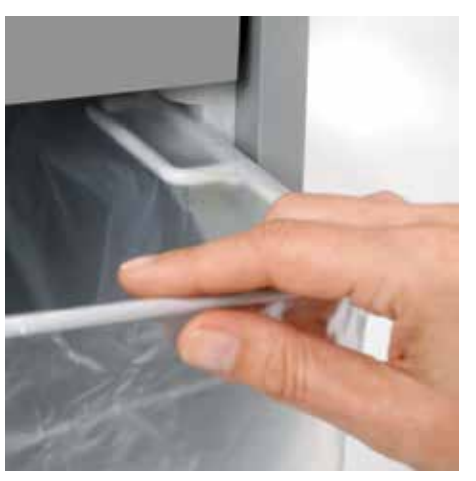
Separate main switch is located on the rear of the Detachable IEC power plug makes the document Pull-out rounded top frame that's kind on the fingers when changing the waste bag