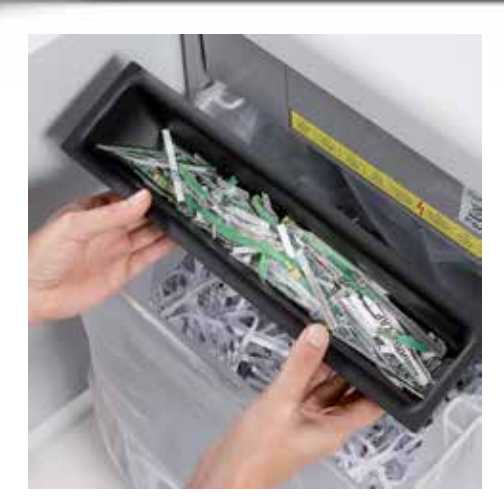
Separate, integrated waste boxes help to sort shredded paper, CDs, DVDs, cheque and credit cards for eco-friendly recycling