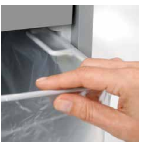
Separate main switch is located on the rear of the Detachable IEC power plug makes the document Pull-out rounded top frame that's kind on the fingers when changing the waste bag